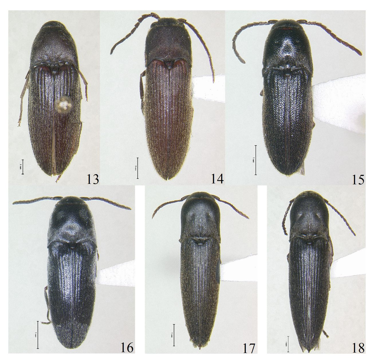
Figures 13–18. Nearctic Eucnemidae, dorsal habitus. 13 ) Fornax parallelicollis. 14 ) Serrifornax infelix. 15 ) Isarthrus calceatus. 16 ) Dromaeolus turnbowi. 17 ) Nematodes humphreyi. 18 ) Nematodes rugosipennis. (Scale: 13–18 = 1.0 mm.)

Forest/ vi.24.2015, S. Myers & M./ Caterino, Sifted litter (1, CUAC); SOUTH CAROLINA: CSC APL 2 050331/ USA: SC: Chichland Co. Columbia/ 3737 Martin St./ Carolina Wood Products/ coll. Friedman 31mar2005/ alphapinae; Lindgren (1, CUAC); USA: SC: Kershaw Co./ SC For. Pine Btl Survey, 28-A/ N 34.4328, W -80.6047/ 7-14 April 2015/ Lindgren residue, D. Jenkins (2, CUAC); USA: SC: Kershaw Co./ SC For. Pine Btl Survey, 28-B/ N 34.3483, W -80.6967/ 7-14 April 2015/ Lindgren residue, D. Jenkins (2, CUAC); USA: SC: Kershaw Co./ SC For. Pine Btl Survey, 28-C/ N 34.4756, W -80.8036/ 7-14 April 2015/ Lindgren residue, D. Jenkins (1, CUAC); USA: SC: Fairfield Co./ SC For. Pine Btl Survey, 20-A/ N 34.3083, W -81.0252/ 7-15 April 2015/ Lindgren residue, D. Jenkins (3, CUAC); USA: SC: Chesterfield Co./ 34.5855° N 80.2690° W/ Carolina Sandhills NWR/ ii.8-22.2017, Lindgren/ M. Caterino & M. Ferro (1, CUAC); USA: SC: Chesterfield Co./ 34.5745° N 80.2232° W/ Carolina Sandhills NWR/ ii.22.2017, in Pinus log/ M. Caterino, M. Ferro &/ R. Hopp (5, CUAC);